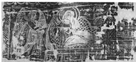
Nativity Scene, resist dyed linen, Akhmin, 4 th century, © Victoria and Albert Museum, London